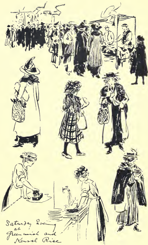
Saturday Evening at Greenwich and Kensal Rise